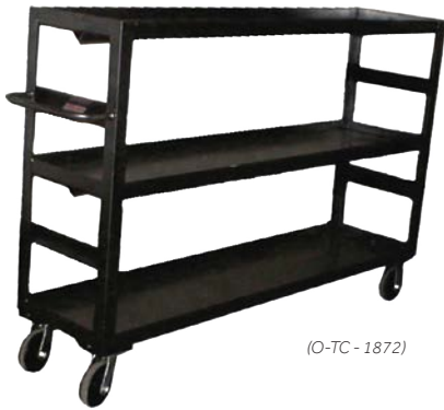
(O-TC - 1872)

The CartWorks Shelf Stock Cart features a durable steel frame with three spacious shelves for efficient storage and transport. Its heavy duty 6 x 2 casters give this cart a massive weight capacity.