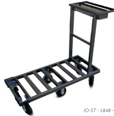
(O-ST - 1848 - 6)

The CartWorks Heavy Duty Stock Truck features a sturdy steel frame, smooth-rolling wheels, and a convenient upper basket. Built for durability, it's ideal for efficiently transporting heavy inventory in any setting.